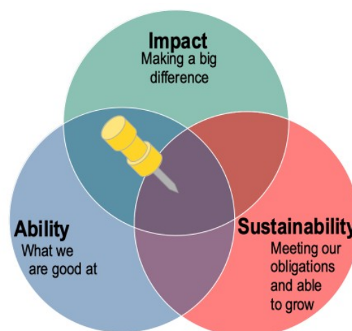
Figure 1: Guiding principles

The Alliance is guided by three overlapping principles: impact , ability , and sustainability . All our activities seek to simultaneously have significant impact, be within the Alliance's abilities together with our partners, and contribute to the sustainability of the Alliance and our members.