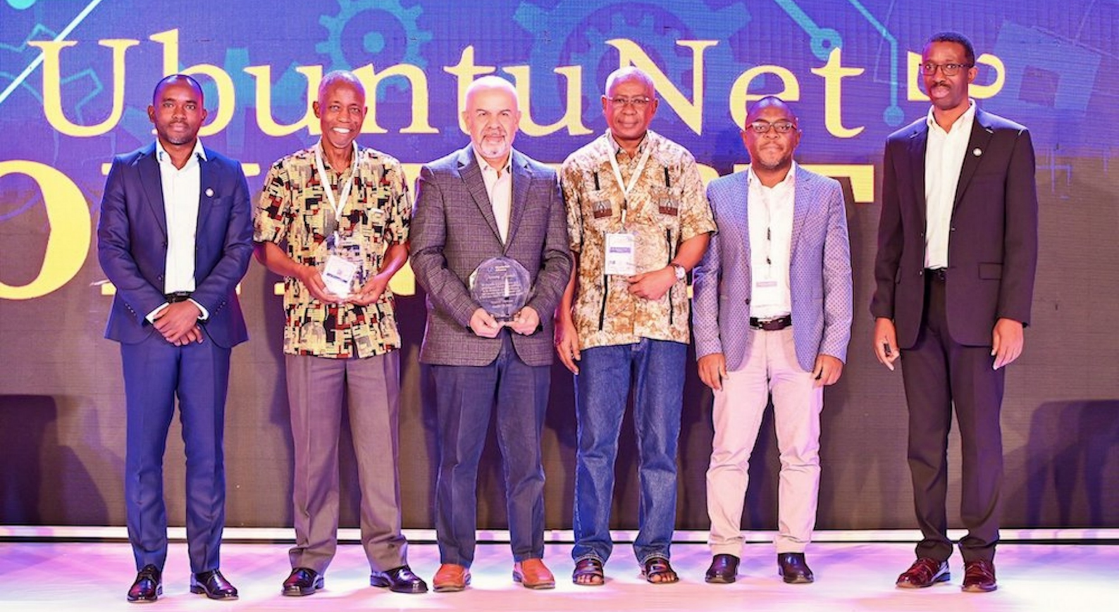
Pioneer Award Recipients