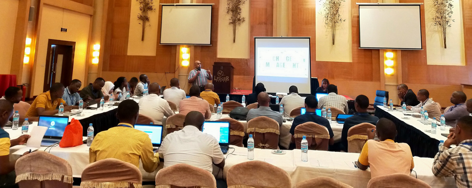
Trust and Identity Training in Dar es Salaam

These documents were as a result of a UK FCDO funded project in collaboration with the University of Nairobi and the University of Johannesburg. Details of the project can be found at https://edt.ubuntunet.net .