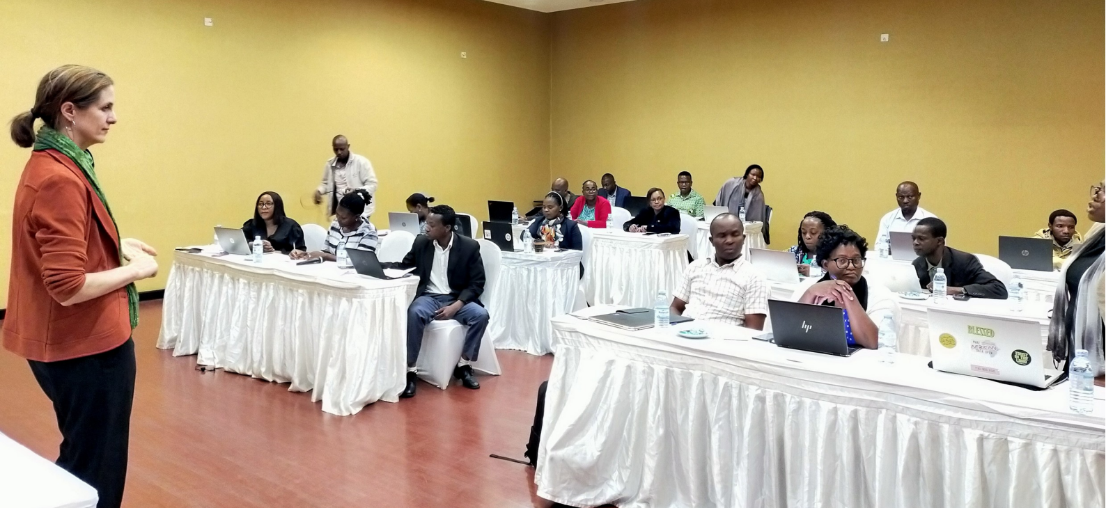
Open Science Workshop, Kampala, Uganda